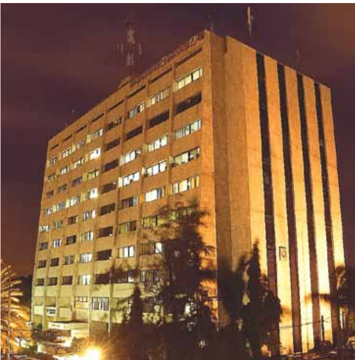
Head Office, Lagos, Nigeria