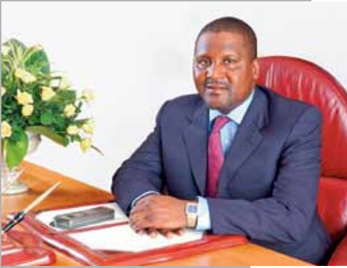
Alhaji Aliko Dangote President / CE