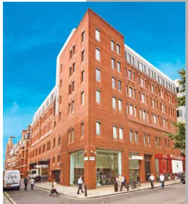
London Office, United Kingdom